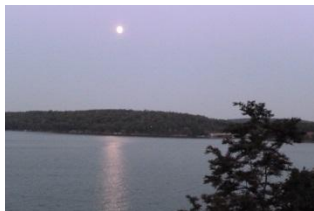
Deep Creek Lake

Location: You will find the perfect place at the Deep Creek Lake State Park's Discovery Center. Through hands-on exhibits that showcase the natural resources of Western Maryland, the center provides education about the flora, fauna, wildlife, cultural and historical heritage that have turned this former logging and coal mining region into a popular modern day vacation destination.