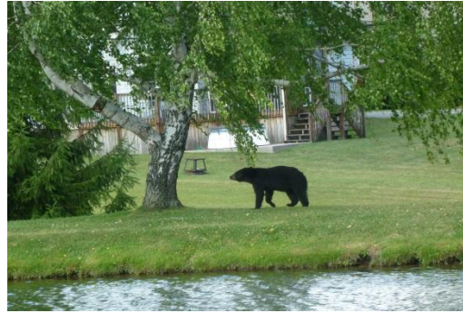
Wildlife at Deep Creek Lake

This Department of Natural Resource's interpretive environmental center is nestled along the shores of Deep Creek Lake. Numerous natural resource exhibits provide a behind the scenes look into Deep Creek Lake, its watershed, and the conservation issues facing the region today. The Discovery Center also features many aquariums with native fish and other aquatic species from the lakes, streams, and rivers. An aviary with live birds of prey, native plant gardens, a Monarch Butterfly rearing tank, a live underwater fish camera and discovery science stations all provide a variety of environmental education. The center also includes a Nature Shop where you will find a variety of educational and environmental gifts.