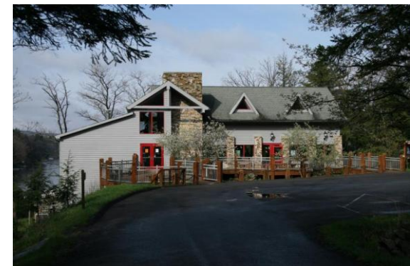
The Discovery Center

DEEP CREEK LAKE GARRETT COUNTY, MARYLAND